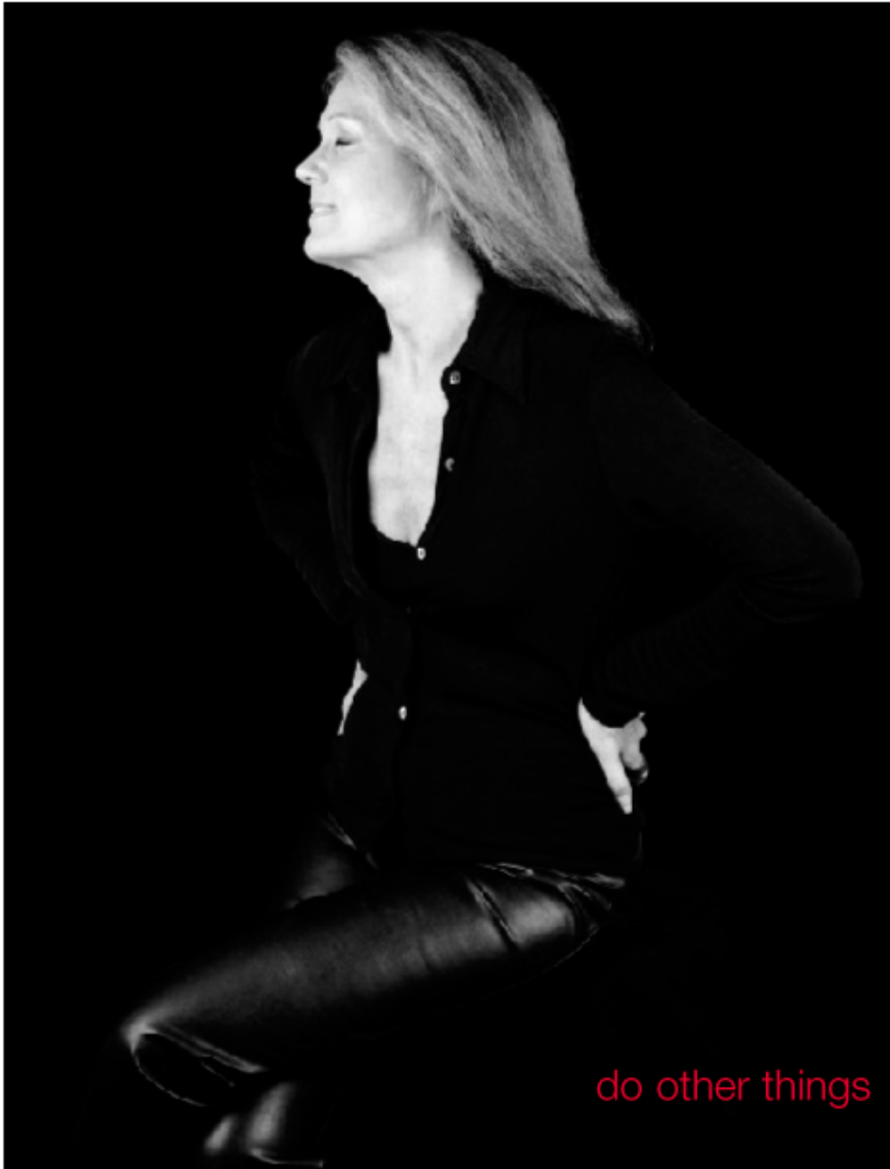
Gloria Steinem, Activist/Author; New York, NY.