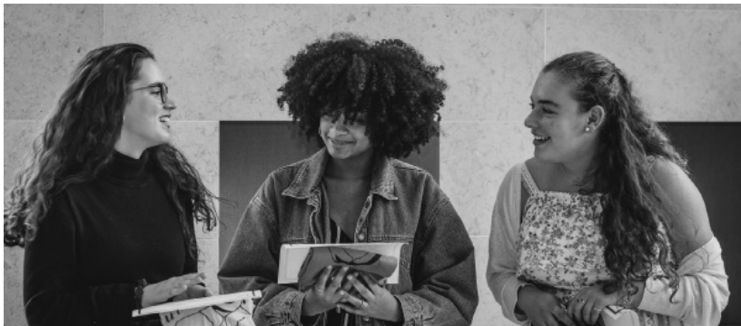
2018-19 Rising Voices Fellows celebrate at their Siyyum (graduation) in May 2019