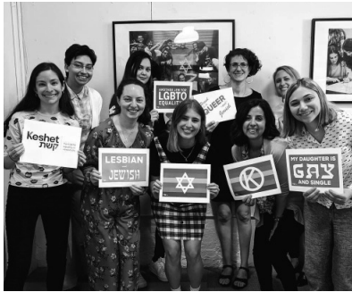
JWA and Keshet staff members stand for LGBTQ and women's equality in Jewish life

“...all [people] are equal partners in shaping communal conversation and driving social change.”