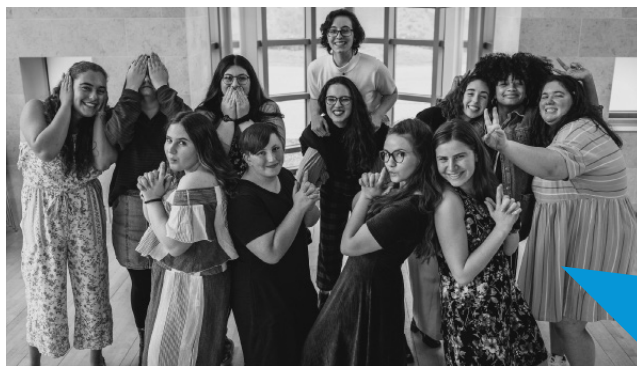
The 2018-19 Rising Voices Fellows at their Siyyum (graduation) celebration May 2019