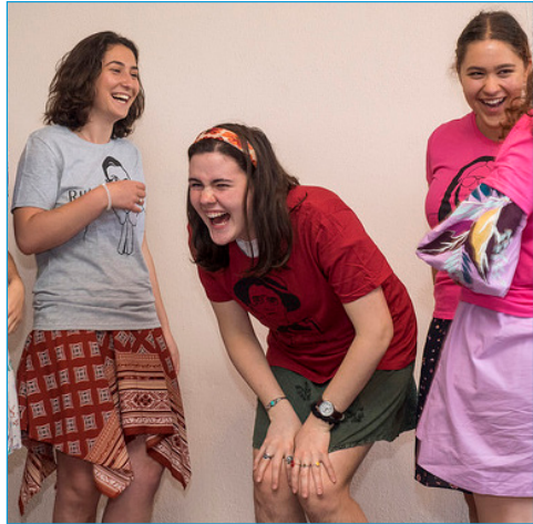
2017–2018 Rising Voices Fellows at their June 2018 graduation